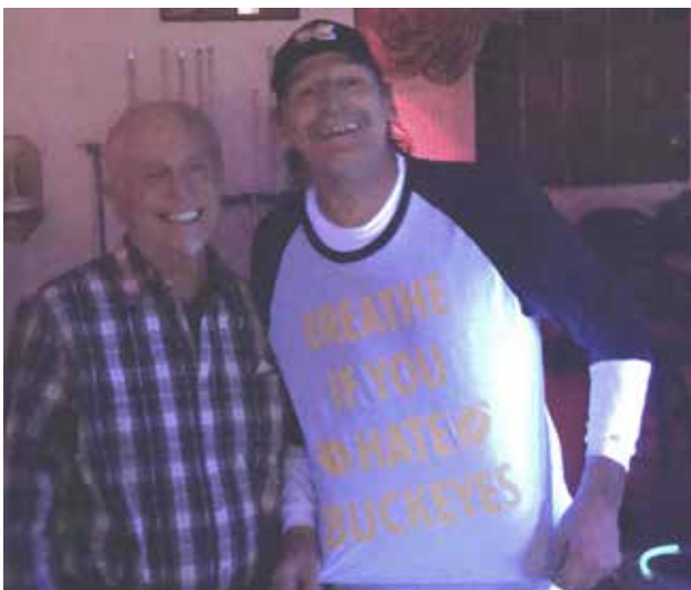
(I know this last photo looks strange, but it was shot under black light only.)