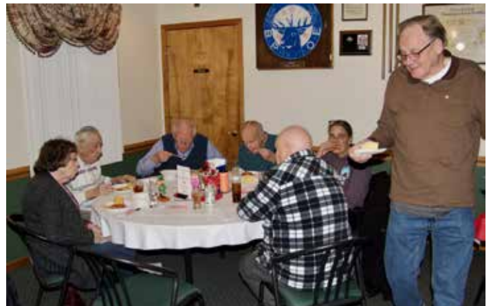
Some of the people