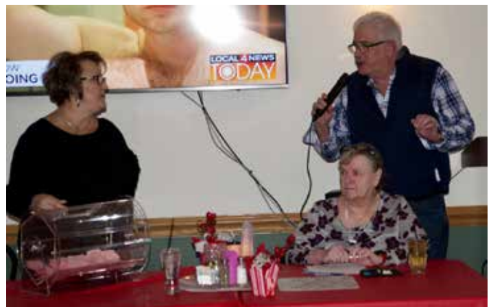
Calling the numbers