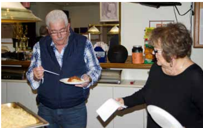
Time to eat