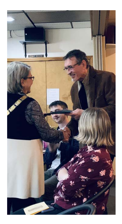
The Installing Past Exalted Rulers