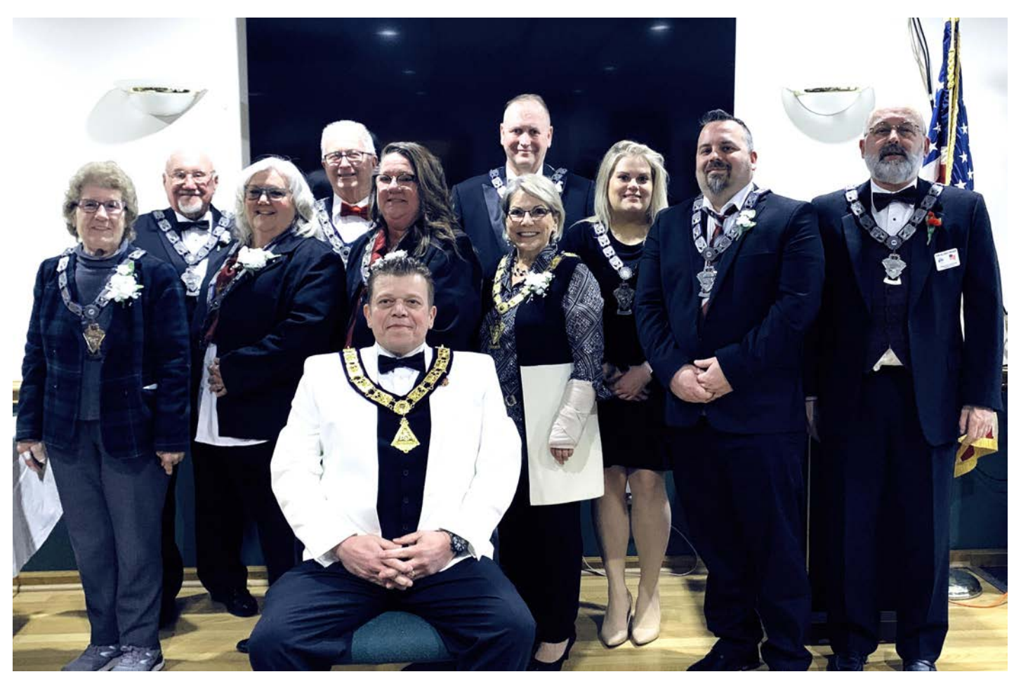
New Officers Taking the Oath of Office