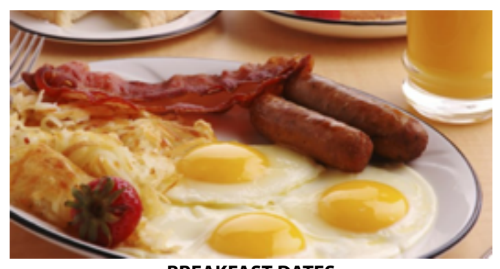
BREAKFAST DATES November 9th & 23rd December 14th & 28th 9 am-Noon

We will be playing Club Pull Tab Bingo during breakfast. Bring your Bingo daubers — don't have one — bring coins, popcorn or candy and have a fun time.