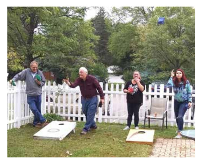
Cornhole players at the PER Steakout on September 28th.

Watch for details on the Children's Christmas Party in the December Track.